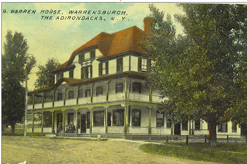
The Warren House, as rebuilt in 1892

Our 21st Sticky Wicket Croquet Games and Picnic took place on August 6 at the Warren County Fish Hatchery. We greatly appreciate the support given by so many are businesses. (Please see page 4)