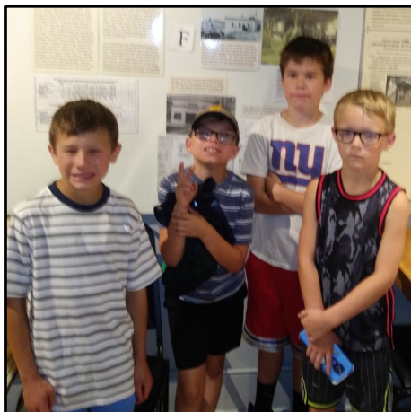
Learning about the trolley