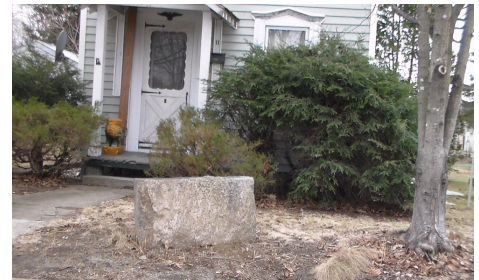
“Horse” block on 1st Avenue