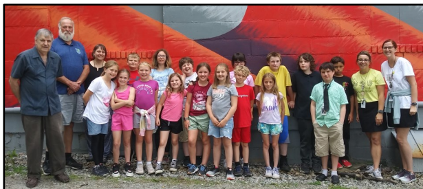
A class of 4th graders at the Museum.