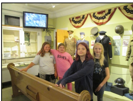
Fourth grade girls in the military exhibit room.