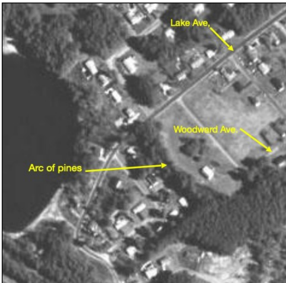
Aerial view of the Arc of Pines as it is today between the ends of Lake Ave. and Woodward Ave.

On page 7 of the Spring Quarterly is a photo of a small white building that's the last remaining building of the old Fairgrounds that used to occupy the area behind Ashe's Hotel. In correspondence with Ben Gurney (WCS '63) he pointed out that there is yet another "structure" that still remains, namely an "arc of pines" that was just outside the south-west curve of the race-track. He provided this photo showing one end of the arc at the end of Lake Avenue and Orton Drive, whence it curves southeasterly into trees beyond the end of Woodward Avenue. One can just visually discern the shadow of the curved path of the racetrack (eg, under the "W" of Woodward). In our correspondence, we discovered that both of us learned to drive in the 1950s on that dirt track outside the embankment. Ben says he was a fanatic about the stock car races in the 1950s and 1960s.