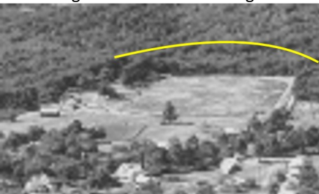
The Arc of Pines lies under the yellow curve at the southwest end of the Fairgrounds race track.