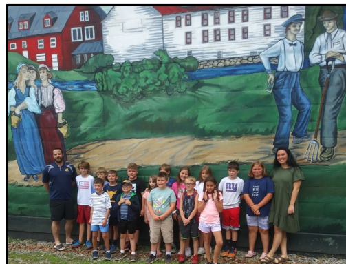
Warrensburg Academy summer school students visited the Museum on August 4.