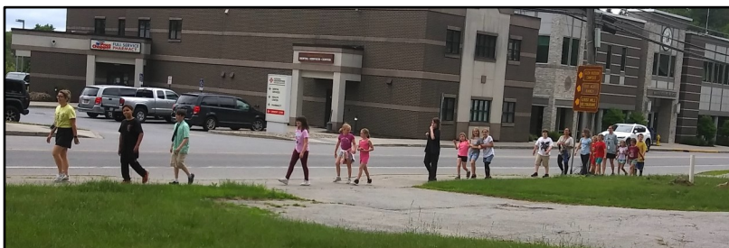
4th graders arrive at the Museum, June 16th.